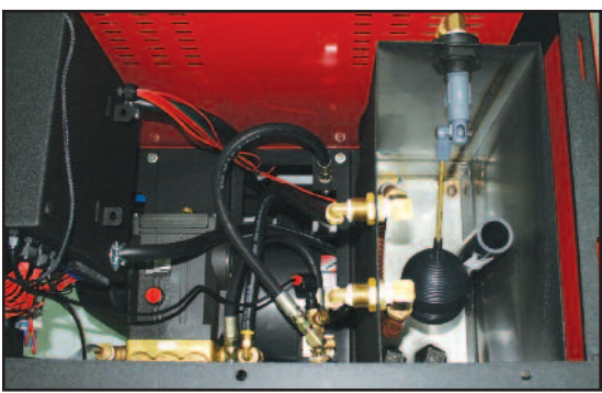
Large 10-gallon polyethylene float tank with cool-down pump by-pass loop to significantly reduce potential pump damage from the operator regularly running the machine in by-pass mode.

To eliminate cavitation, both sides of the pump are fed from the 10-gallon float tank that provides "flooded suction". The pump also has an oil drain , allowing for easy oil changes.