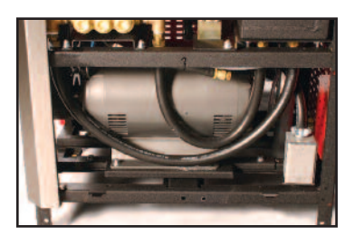
Motor is mounted to slide out rails for easy removal